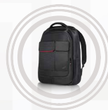
ThinkPad Professional Backpack