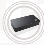
ThinkPad ThunderBolt Dock