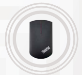
ThinkPad Precision Wireless Mouse